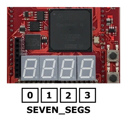
Figure 5: Seven segment displays.

In this section, you will implement a display_score procedure to show the game score on the 7-segment displays.